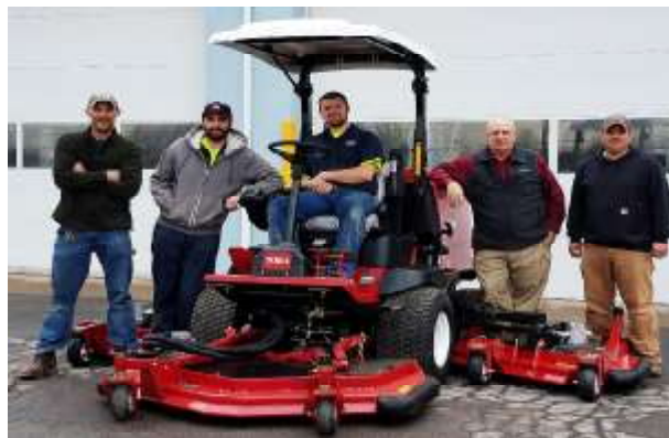
The staff at Farmington Parks with their new Toro Groundsmaster 4000