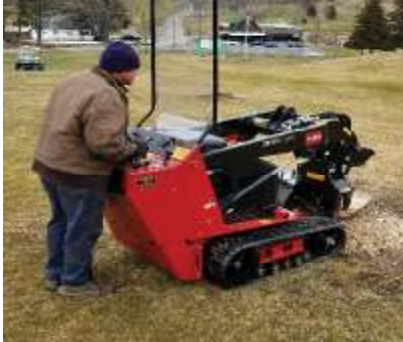
George from Endwell Greens Golf Course tries out his new Toro Dingo with stump grinder attachment.

Currently in the final stages of development and testing, Toro will be expanding their compact utility loader product offering through the introduction of the brand-new Toro® Dingo® TXL2000. Available in late 2018, the TXL2000 represents a continuation of 20 years of dedication and innovation of the Toro Dingo and the compact utility loader (CUL) design. As the original pioneer of the CUL in the North American marketplace, the development of the TXL2000 was based on feedback from end users.