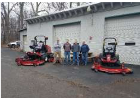
Geneva City Parks with their new GM4000 and GM3280