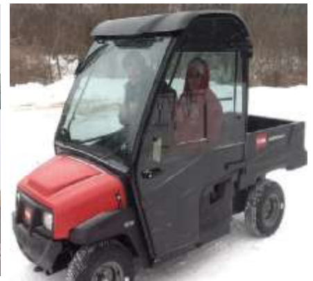
The gang at Keuka Lake State Park take delivery of their New Toro GTX Workman.