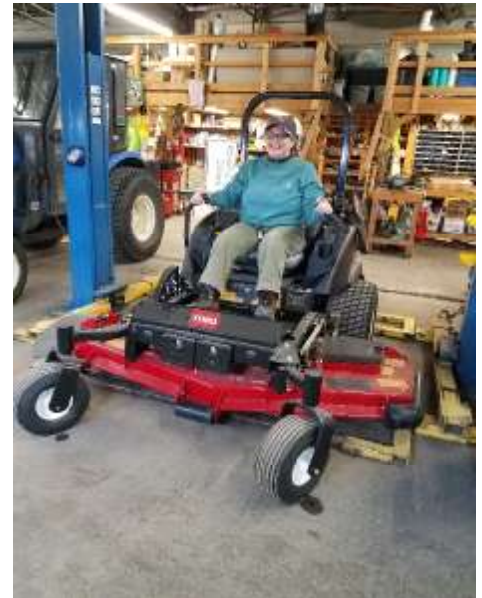
Canandaigua City Parks with their new Toro Groundsmaster 7210